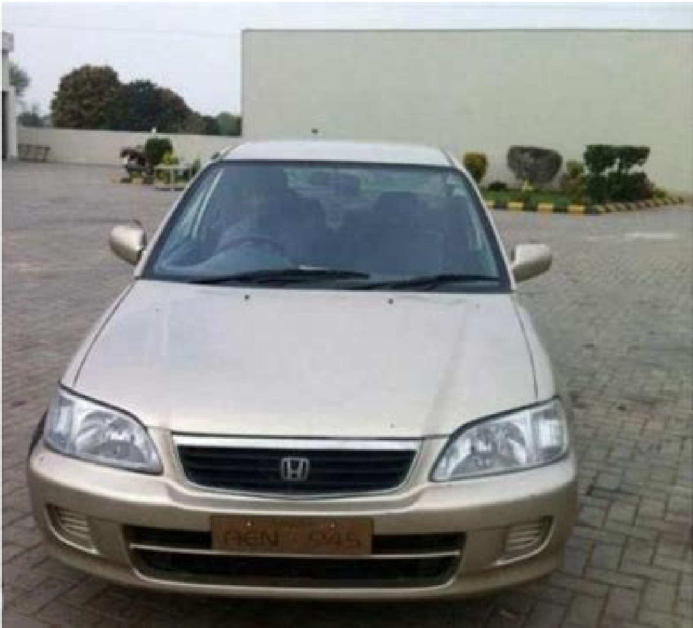
Honda city 2018 user manual pdf. Honda city pakistan user manual.